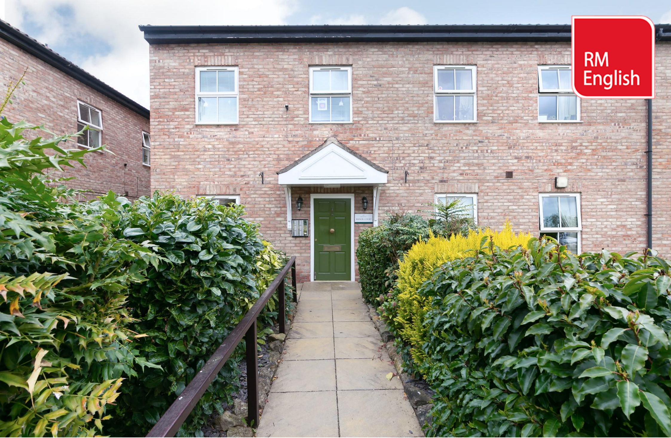
2 Manor Court, Buttercrambe Road, Stamford Bridge, YO41 1AJ