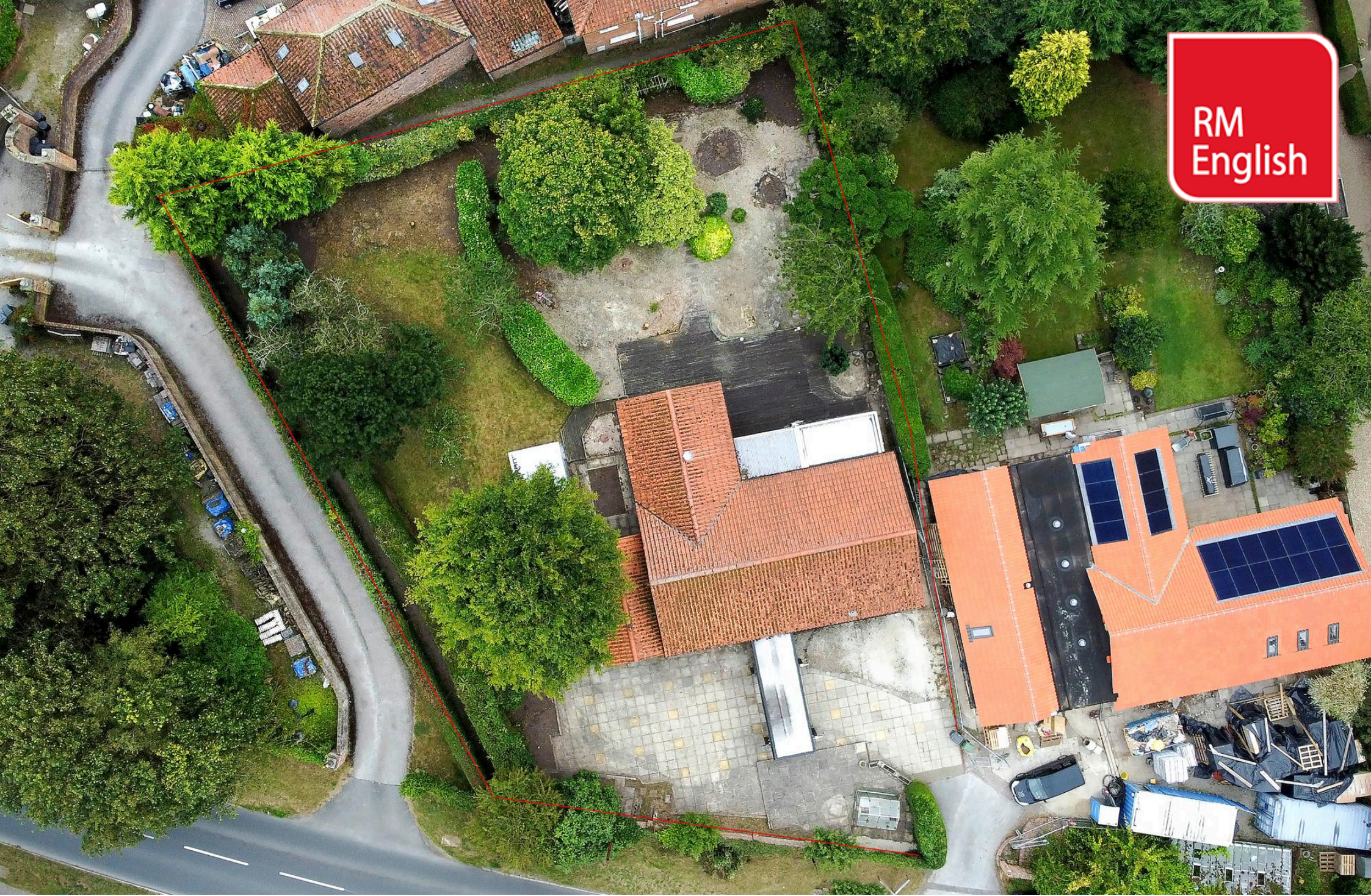
Main Street, Elvington, York, North Yorkshire, YO41 4AA