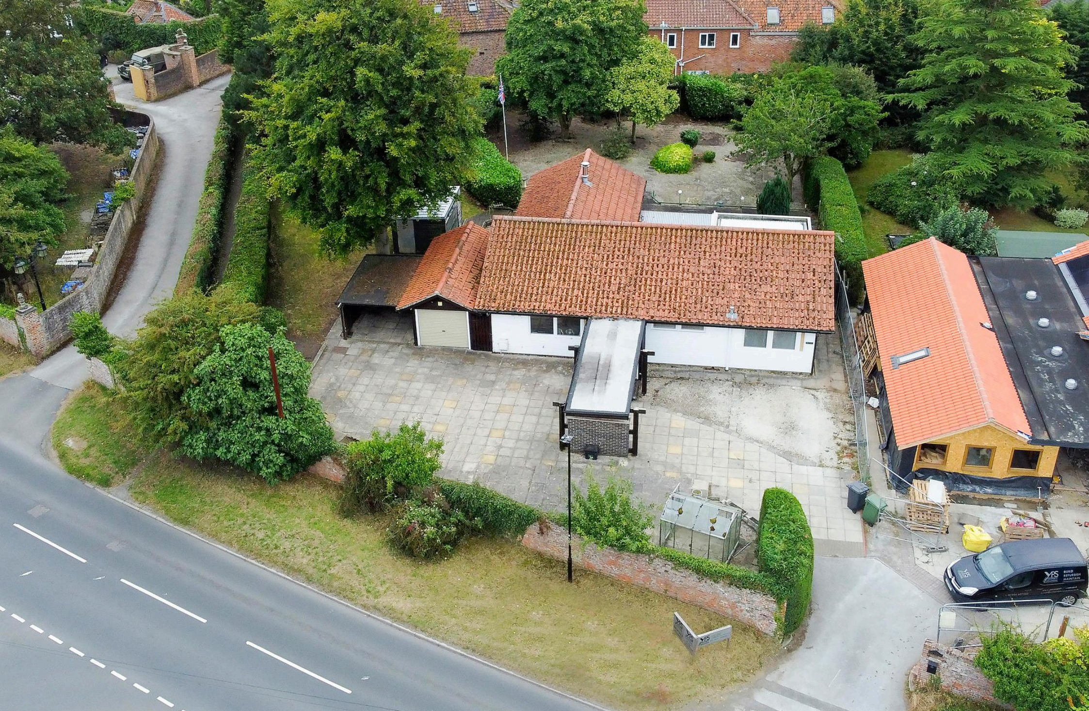
A SCANDINAVIAN STYLE BUNGALOW WITH A SUBSTANTIAL PLOT