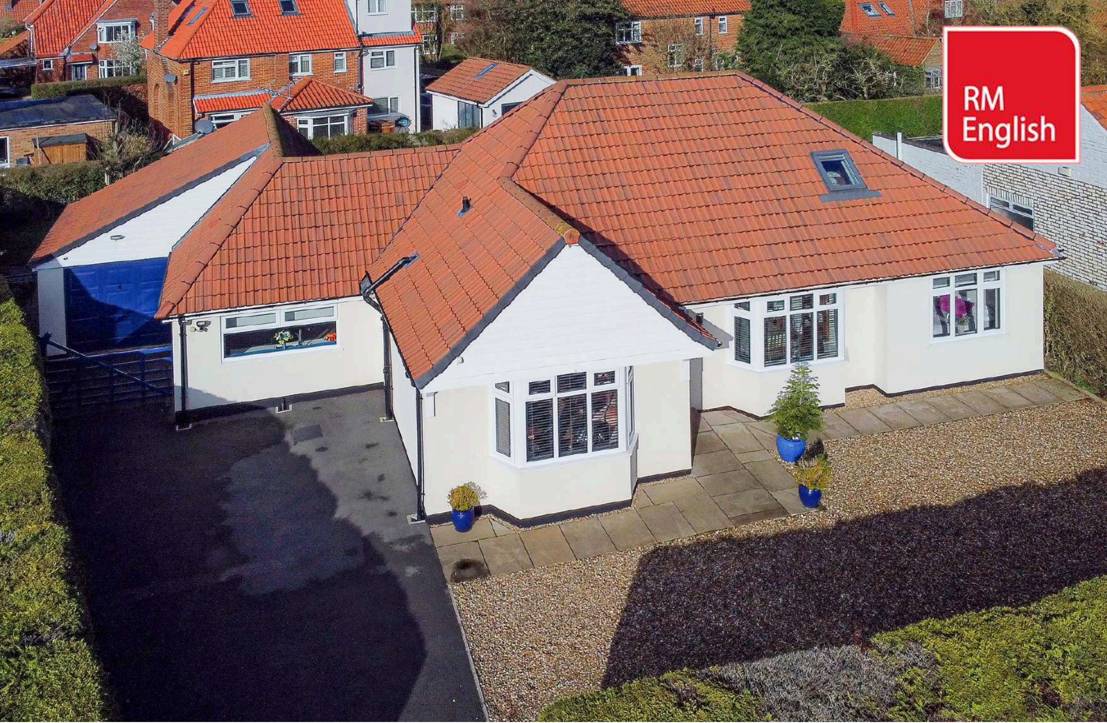
Algarth Road, Pocklington, York, YO42 2HJ