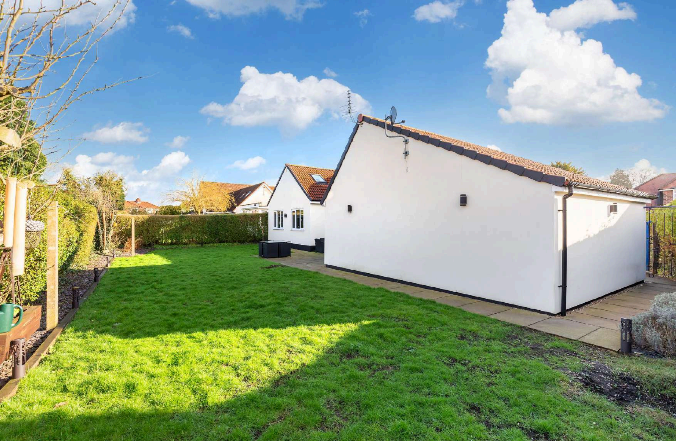
SPACIOUS FAMILY HOME WITH LARGE GARDEN