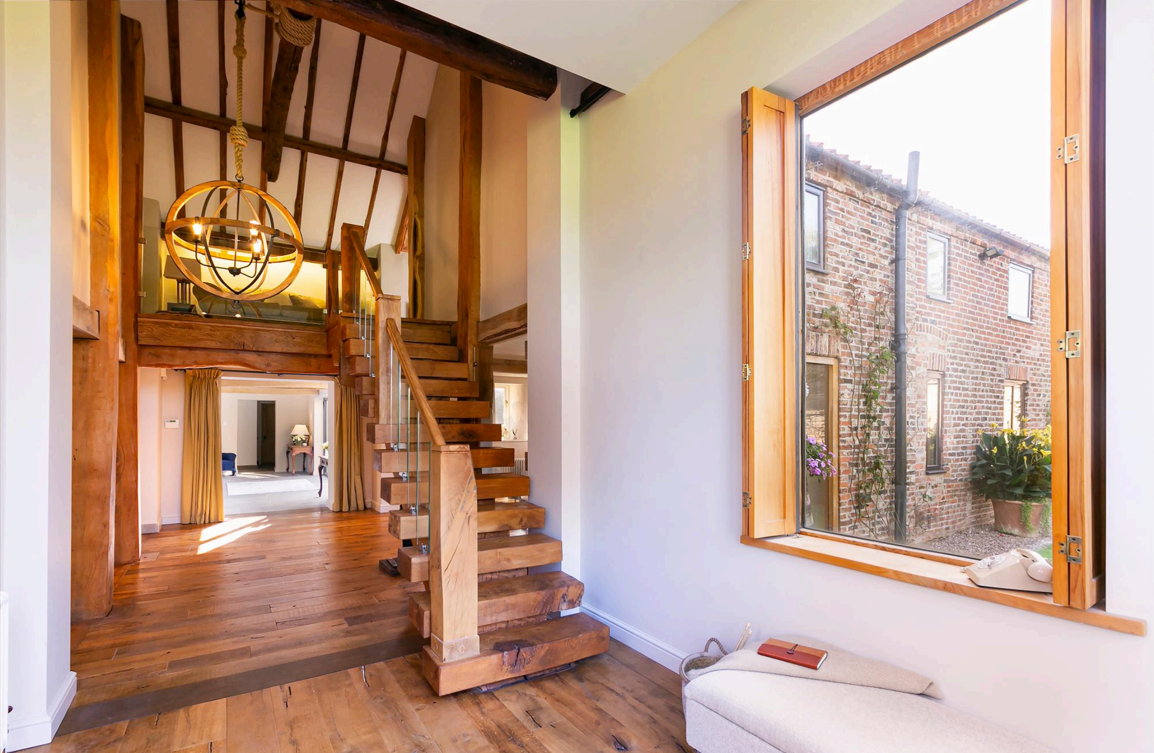
A TRULY STUNNING FAMILY HOME WITH A SUBSTANTIAL MATURE GARDEN