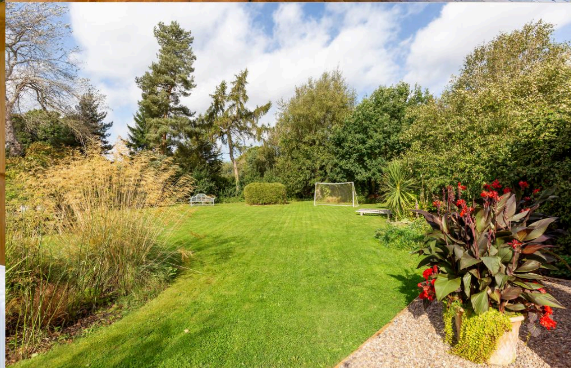
Hull Road, Wilberfoss, York, YO41 5PD