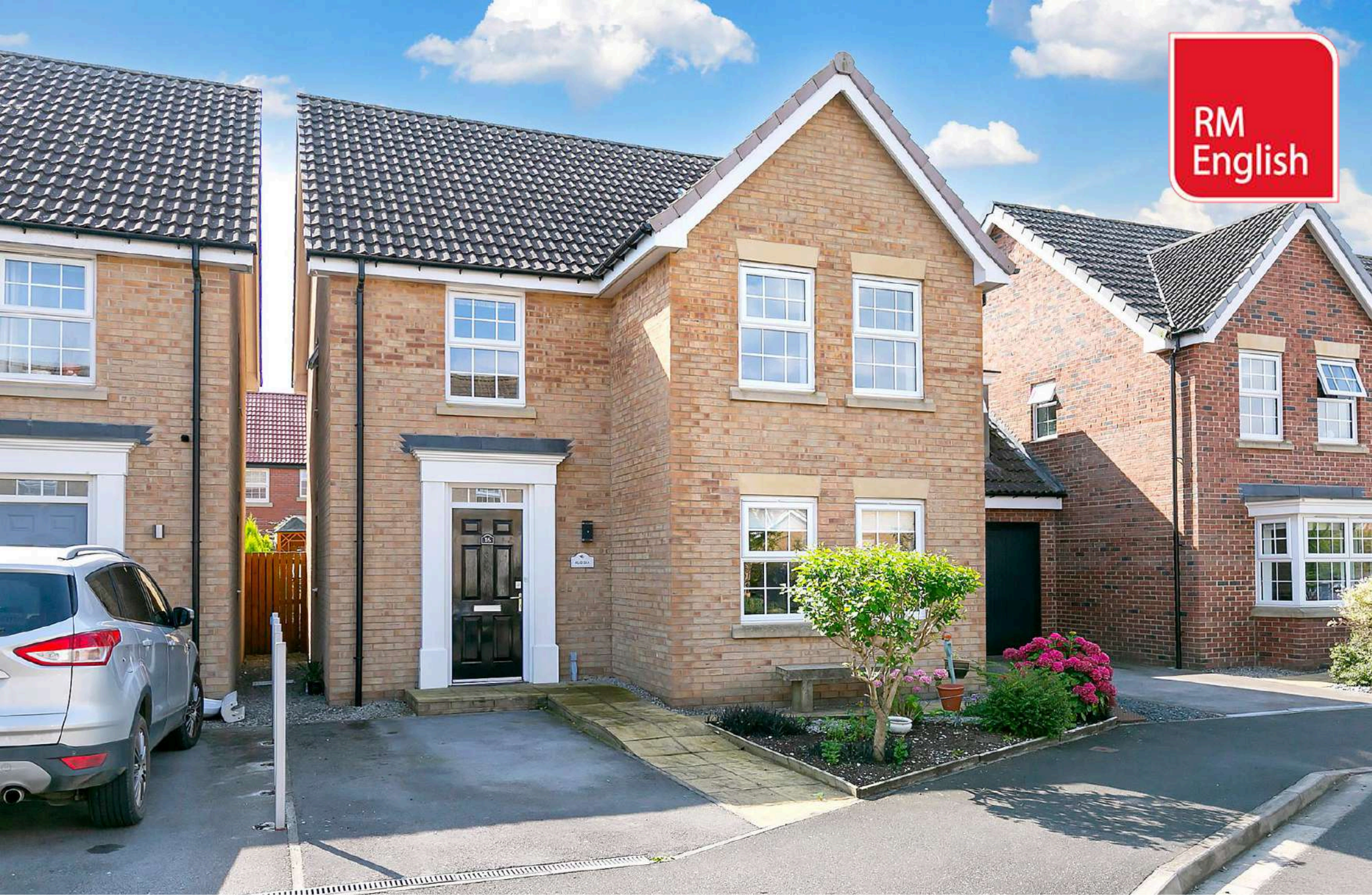
16 Medforth Street, Market Weighton, YO43 3FF