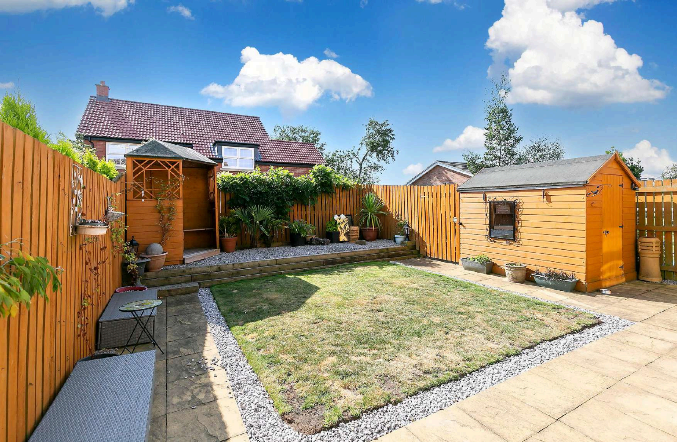
ENCLOSED SOUTH FACING REAR GARDEN