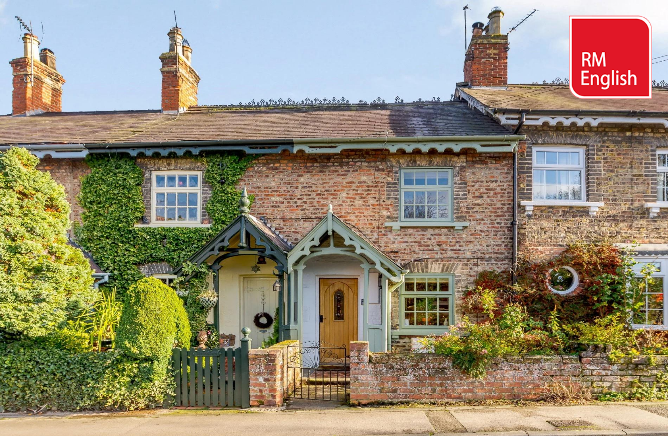
Church Lane, Elvington, York, North Yorkshire, YO41 4AD