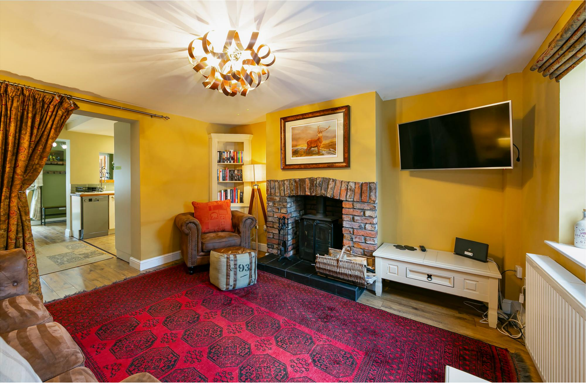
A STUNNING PERIOD COTTAGE WITH NO ONWARD CHAIN