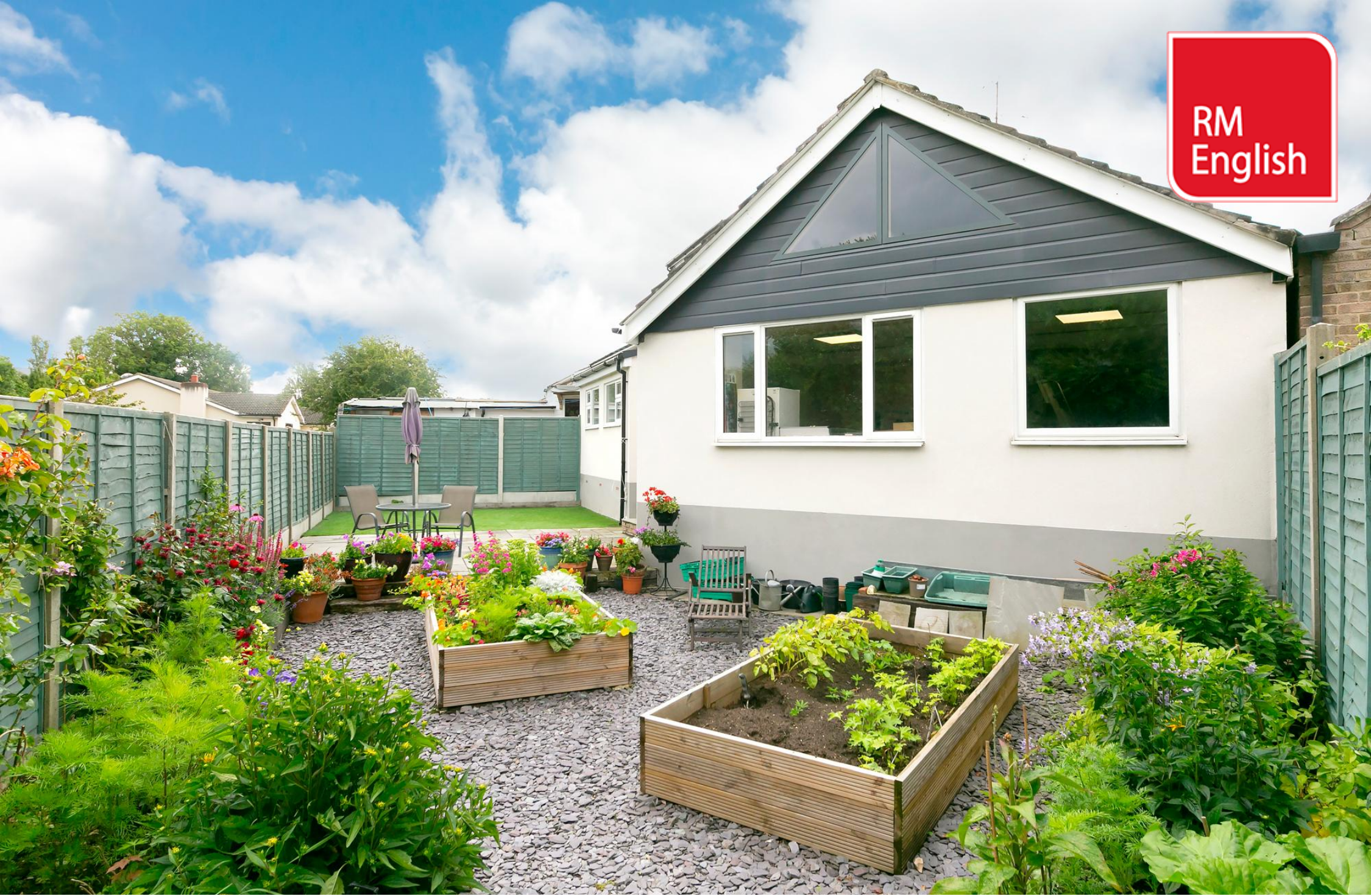
30 Northgate Vale, Market Weighton, York, YO43 3EA