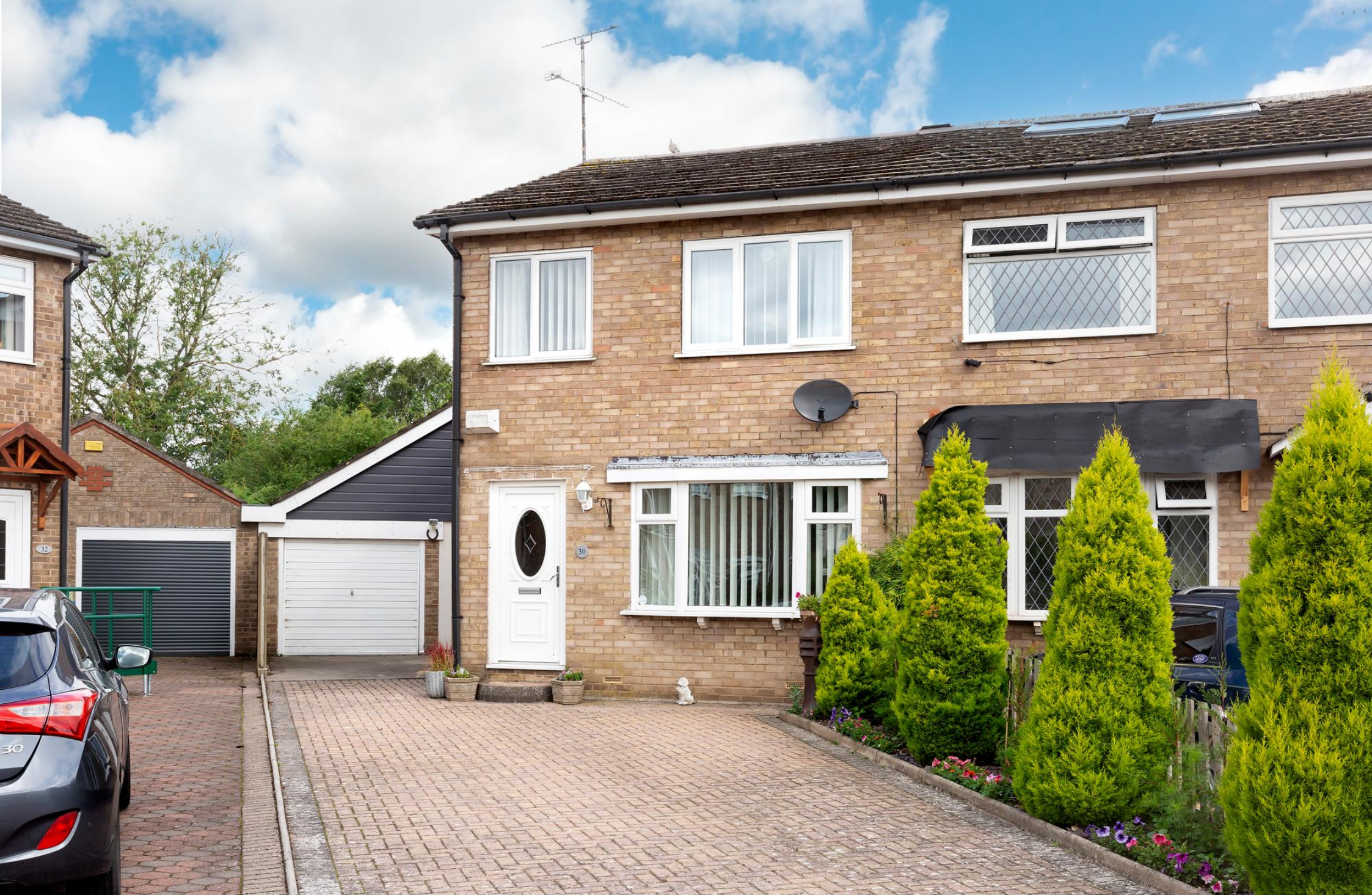
Spacious semi detached house with large garage and workshop area