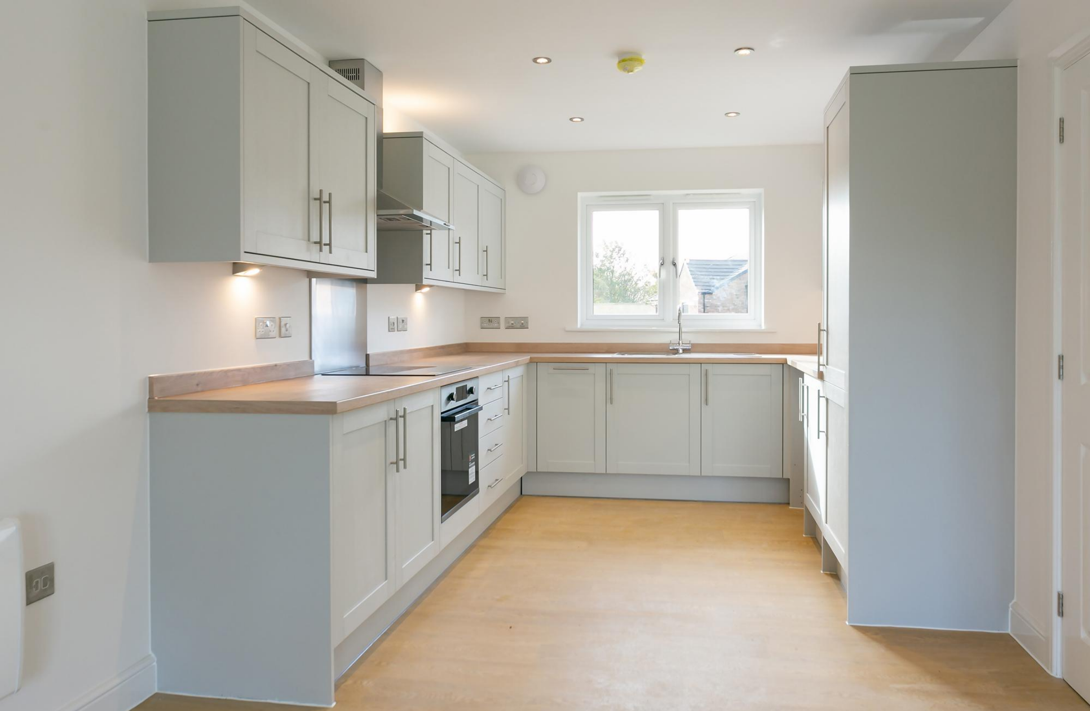
LUXURIOUS BUNGALOW SITUATED IN A UNIQUE RETIREMENT VILLAGE SURROUNDED BY COUNTRYSIDE