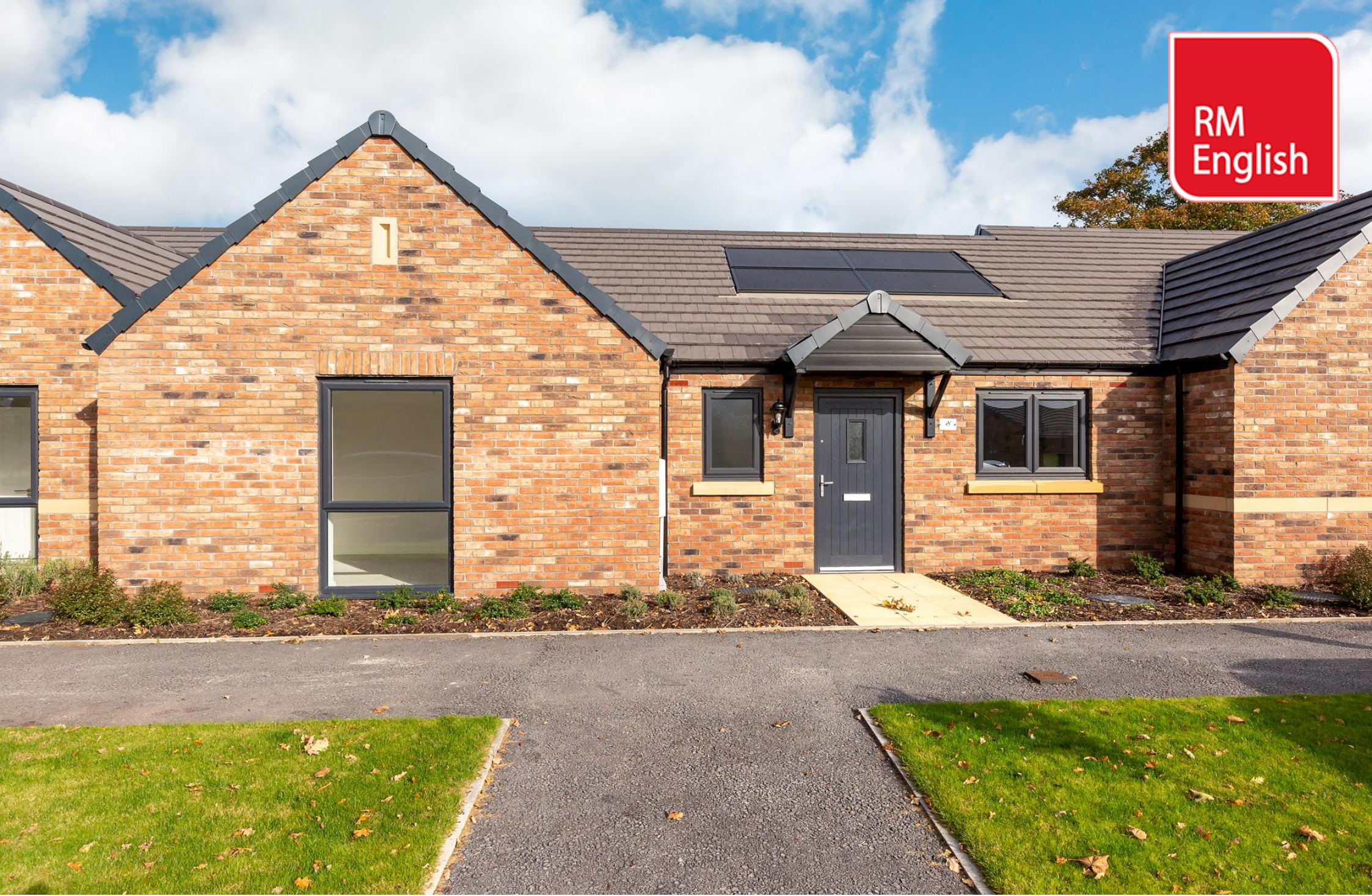
8 Lavender Fields, Feoffee Common Lane, Barmby Moor, York, YO42 4AF