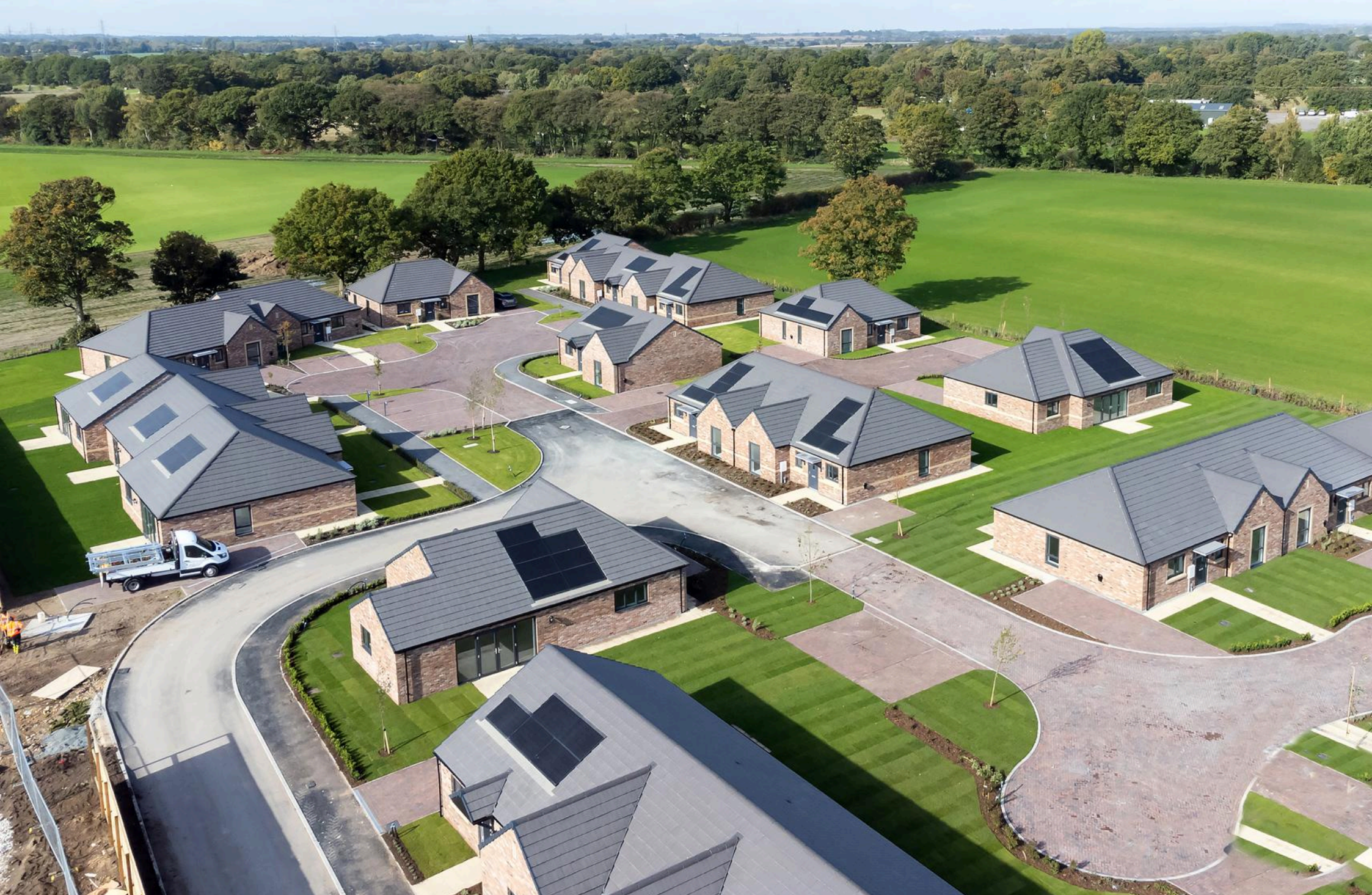
Semi detached bungalow