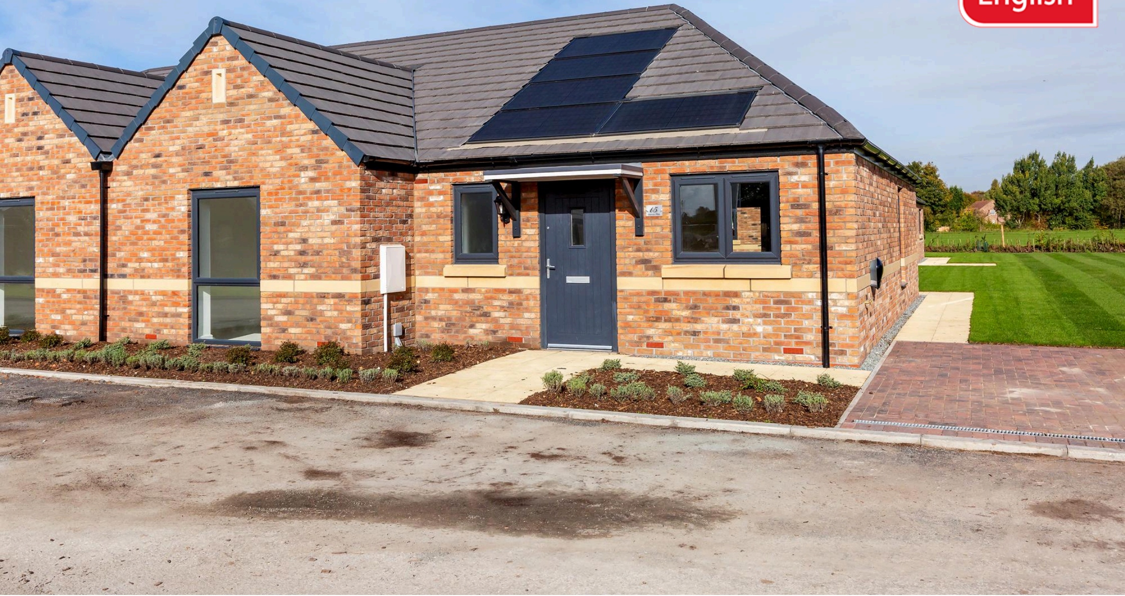
15 Lavender Fields, Feoffee Common Lane, Barmby Moor, York, Yorkshire, YO42 4AF