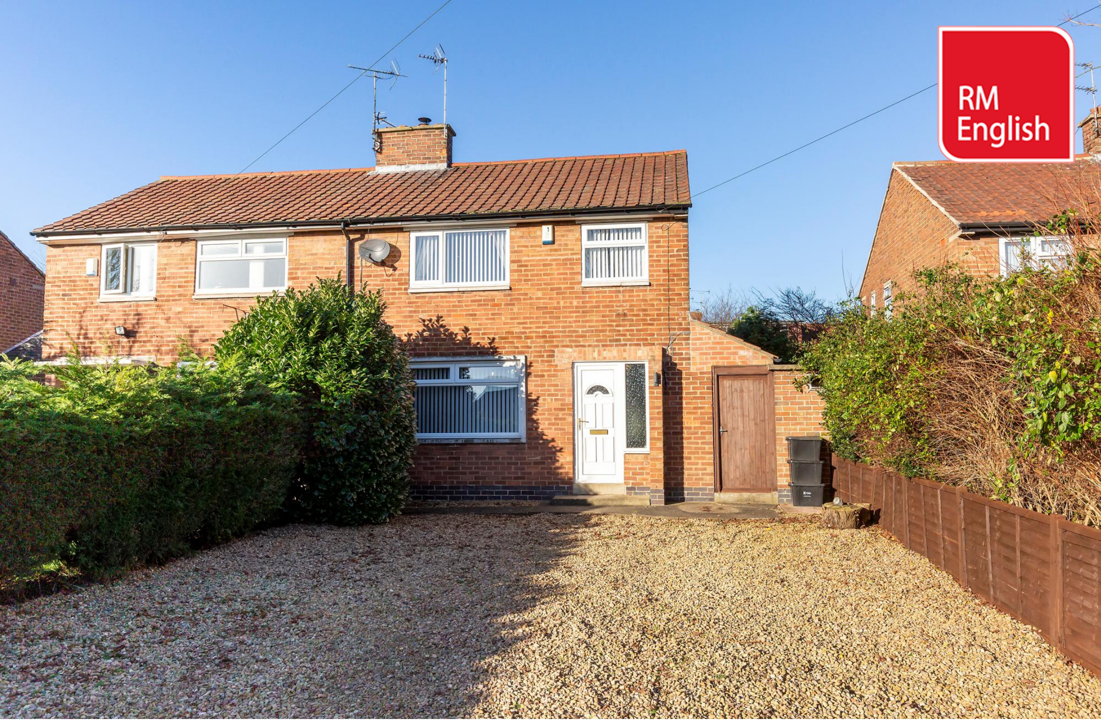
126 Thoresby Road, York, YO24 3EP