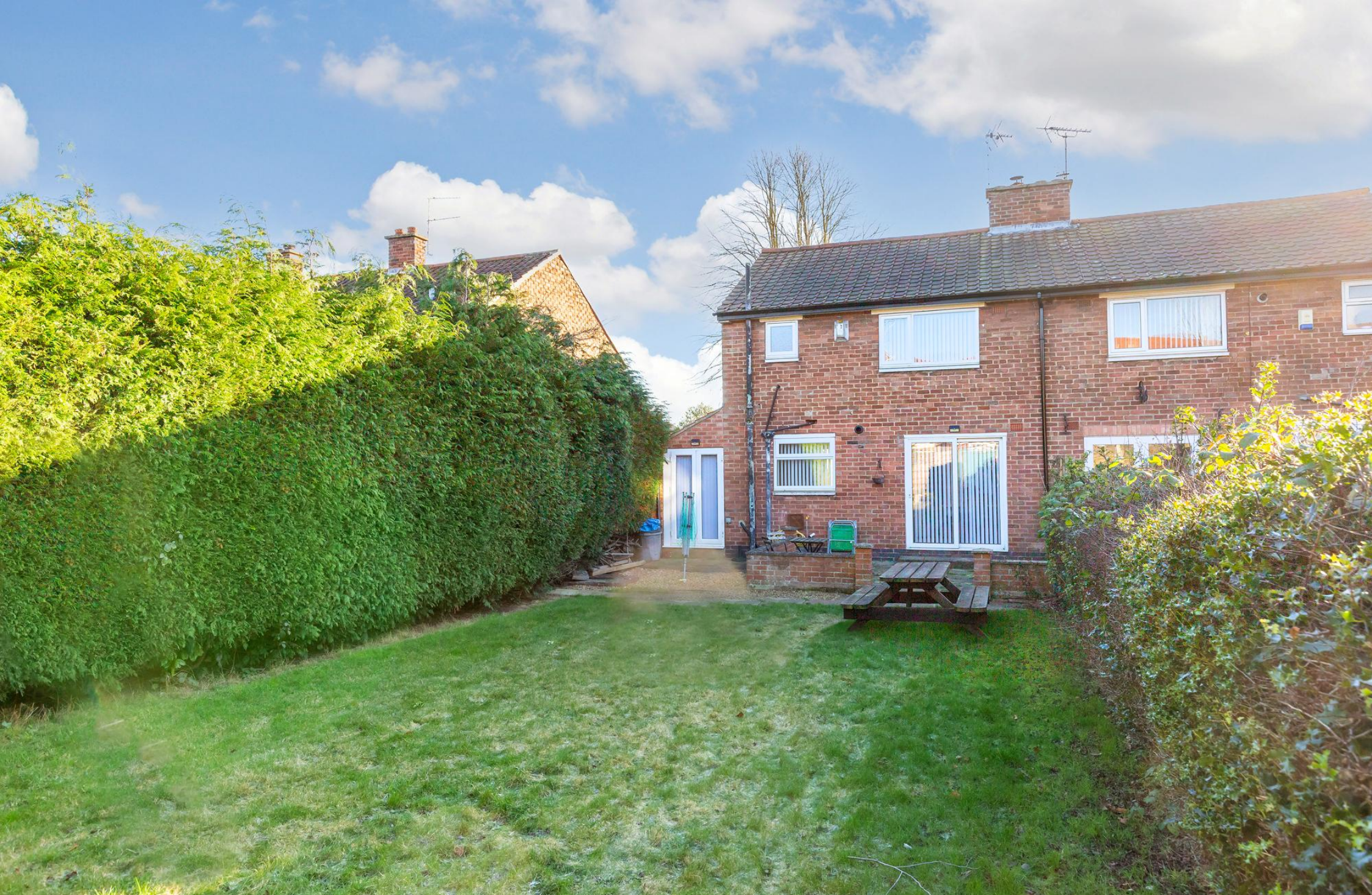
Beautifully presented semi detached house with enclosed rear garden