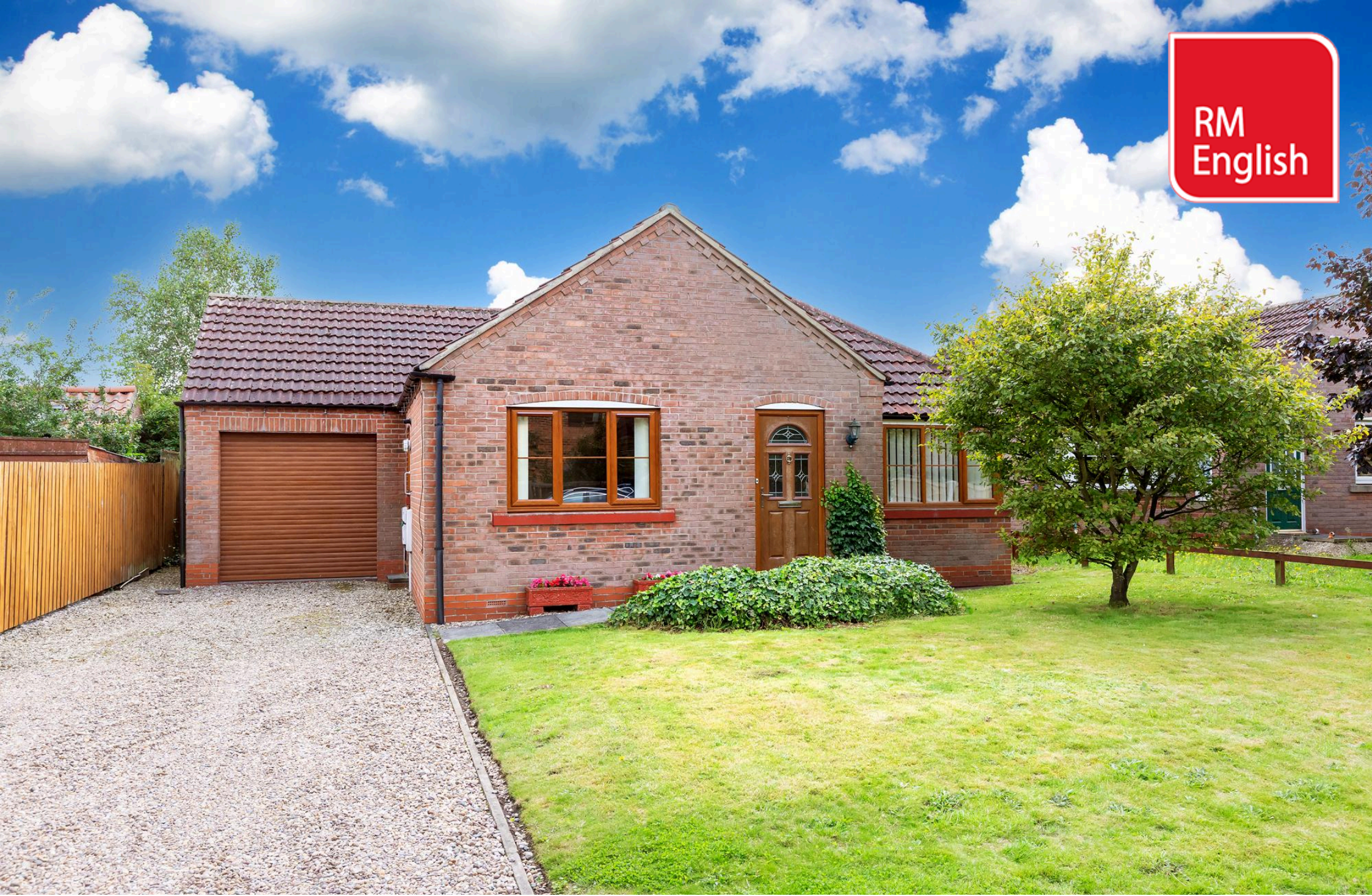
1 Swales Drive, Market Weighton, YO43 3BF