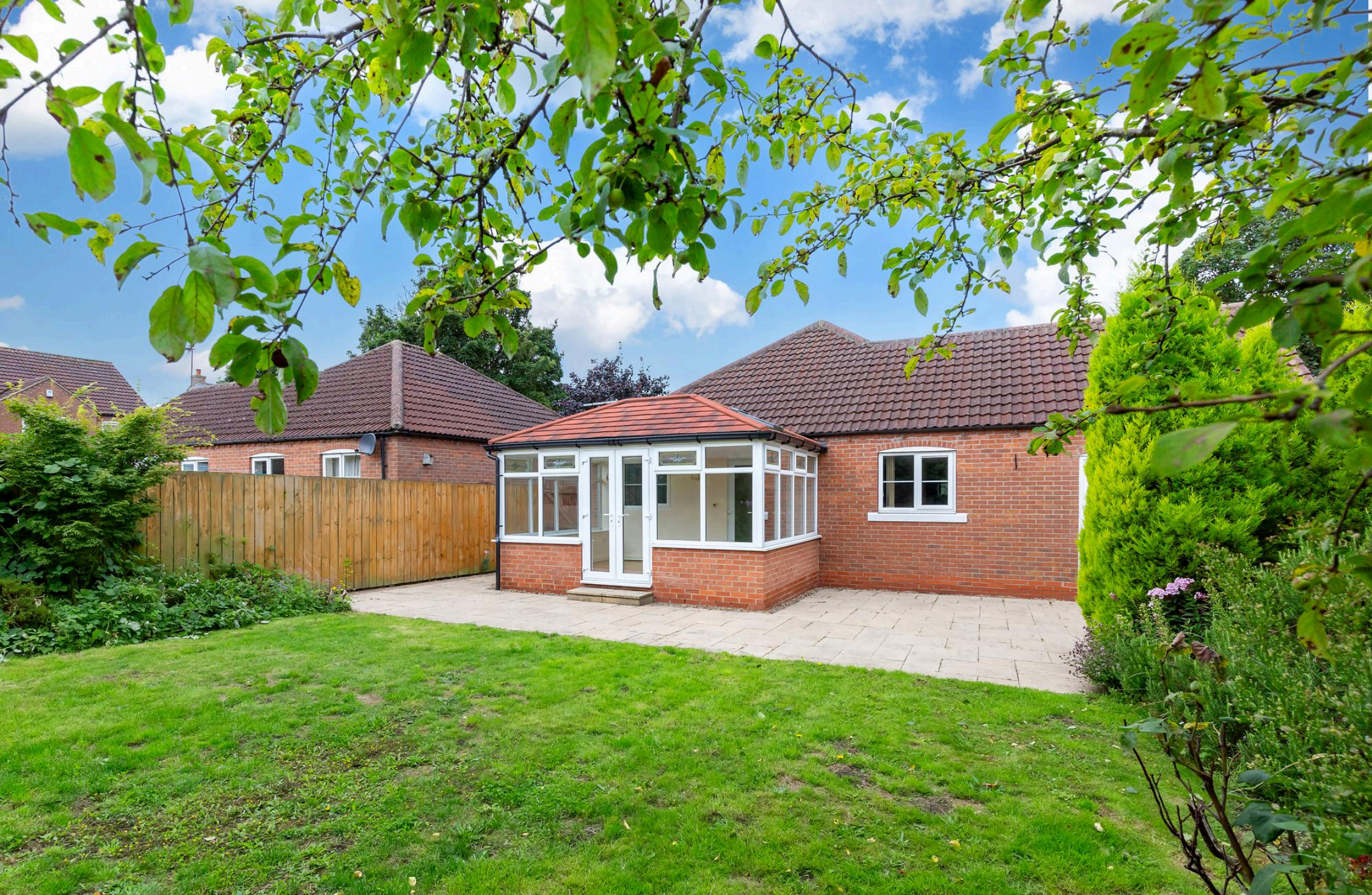
Spacious detached bungalow set in private cul de sac close to town centre