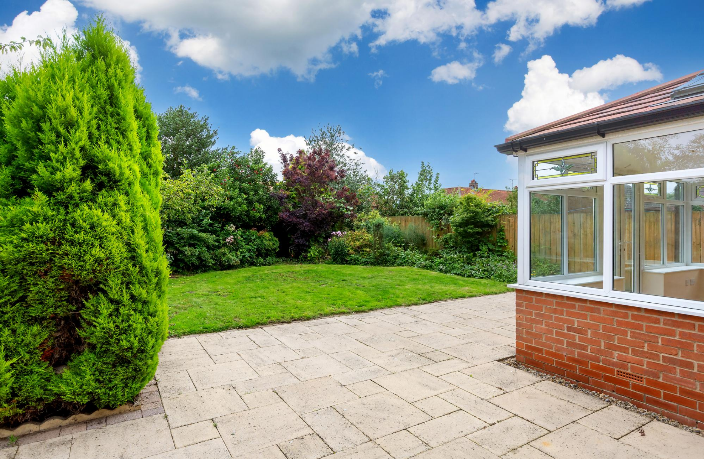
Spacious detached bungalow set in private cul de sac close to town centre