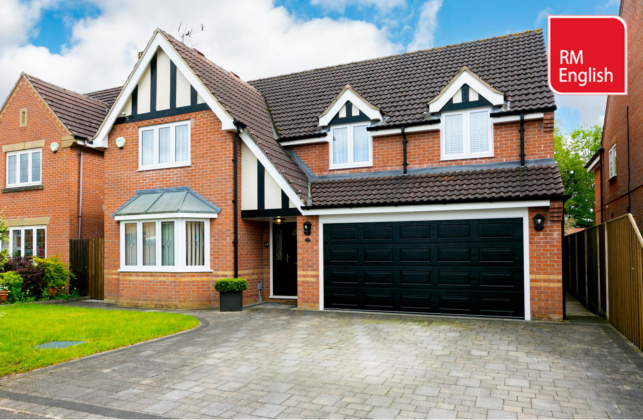
Nicholson Court, Pocklington, York, YO42