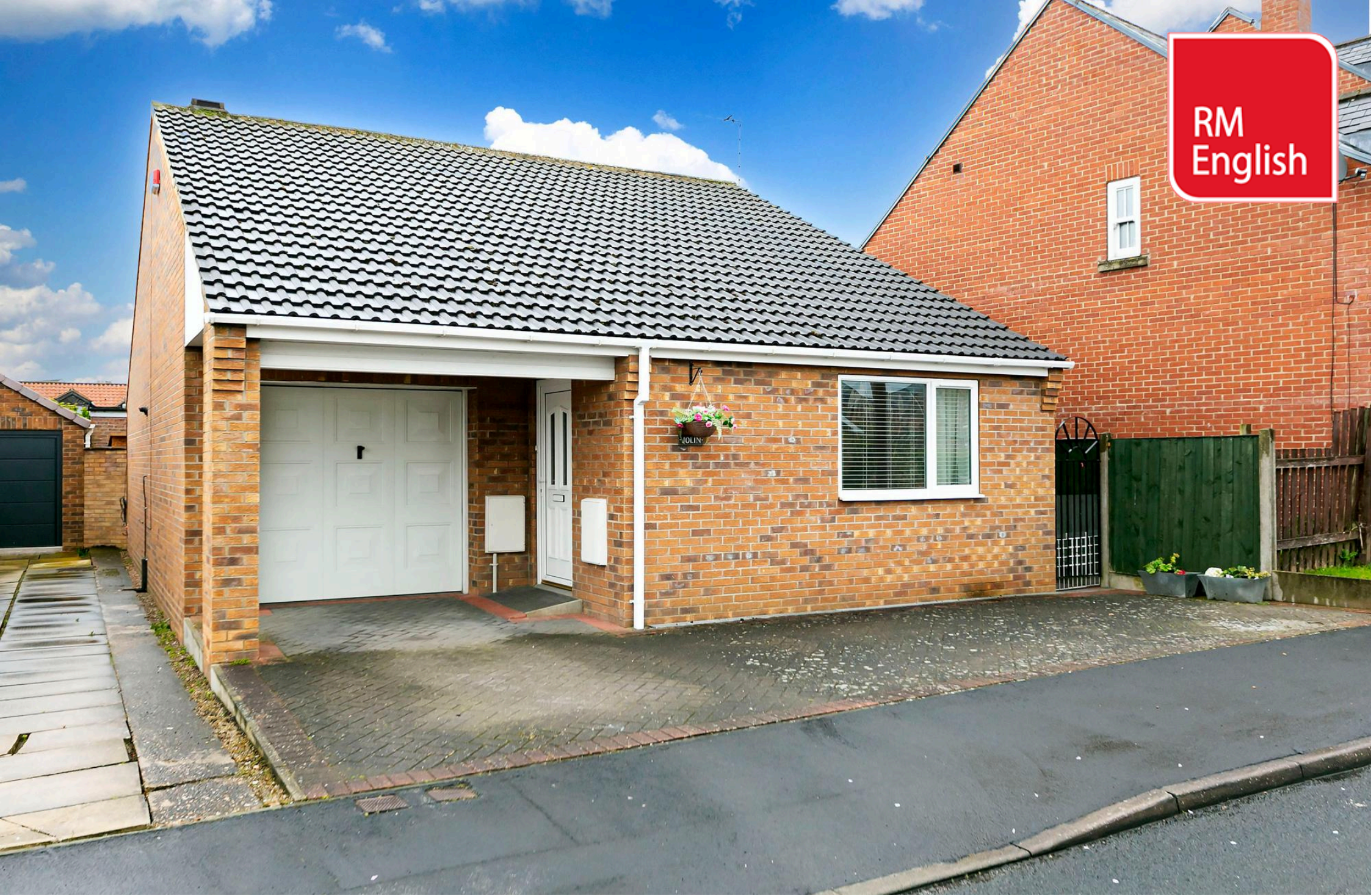
Jolin, Skelton Crescent, Market Weighton, YO43 3EB