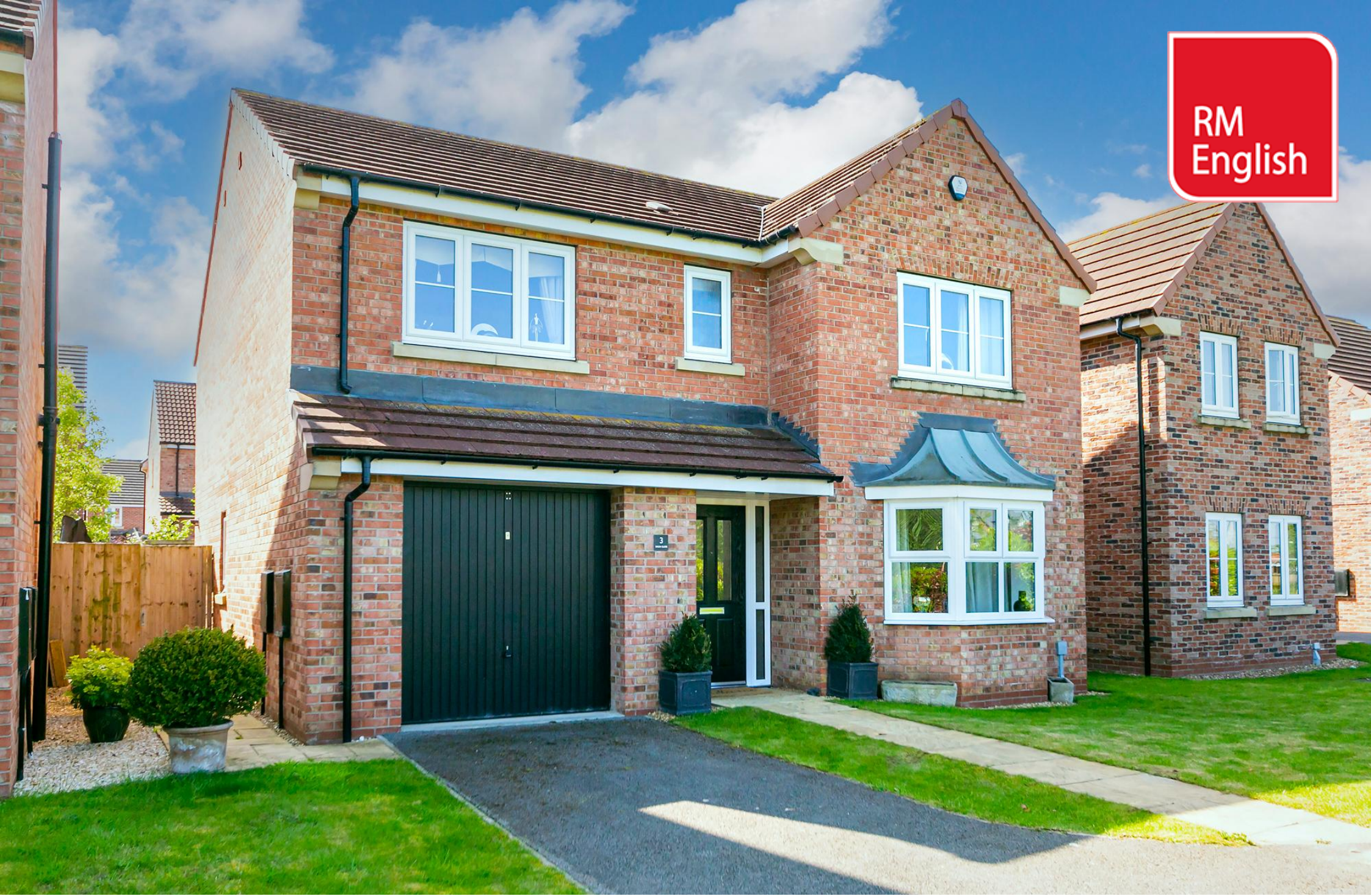
3 Birch Close, Market Weighton, YO43 3FQ