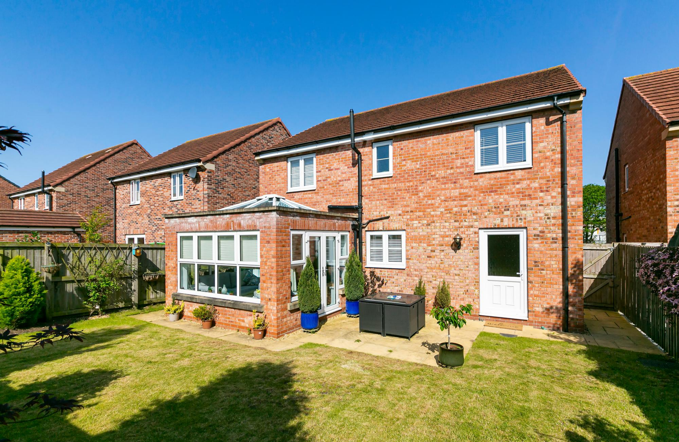
Immaculate detached house