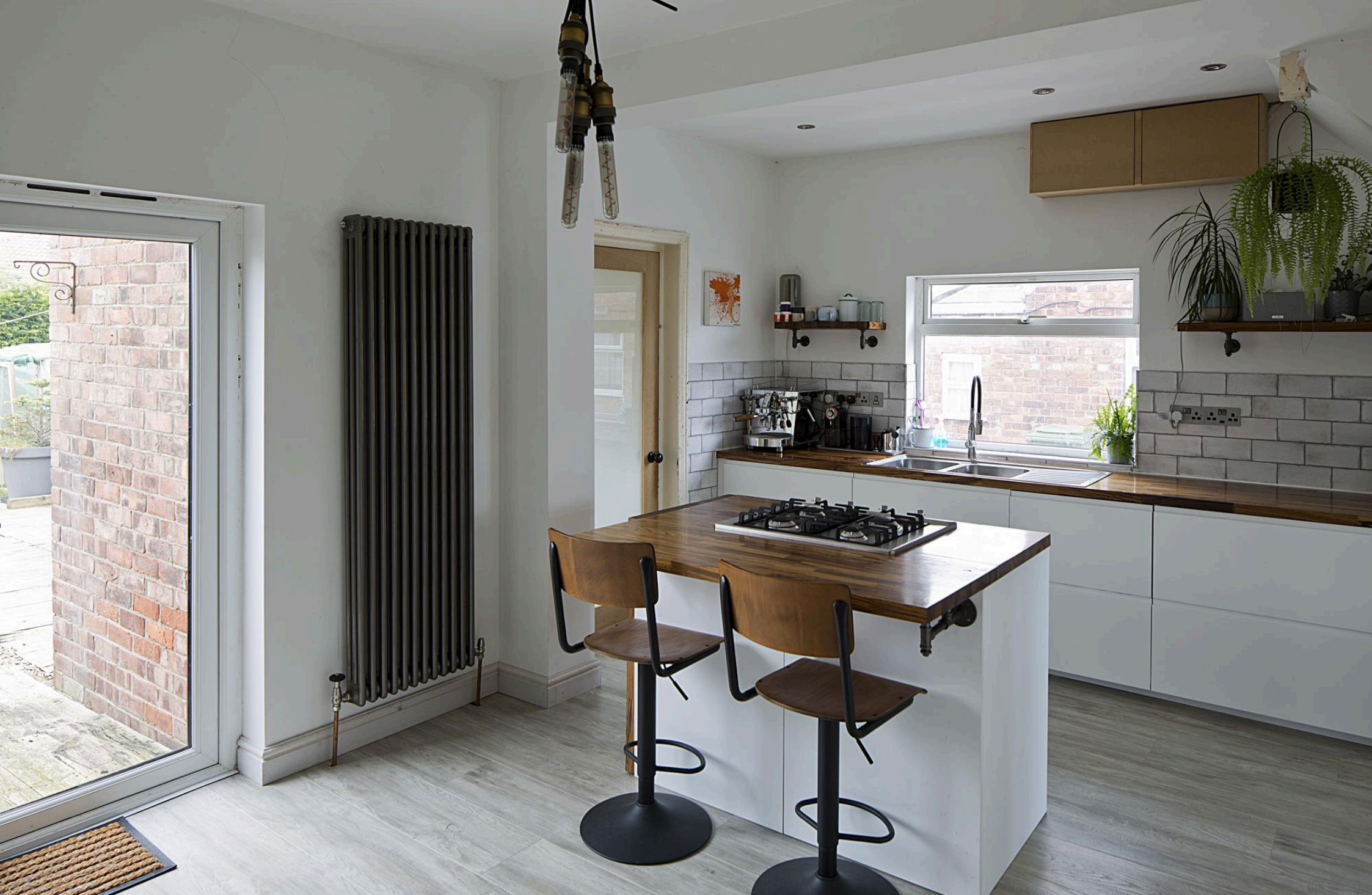
MODERN OPEN PLAN KITCHEN/DINER