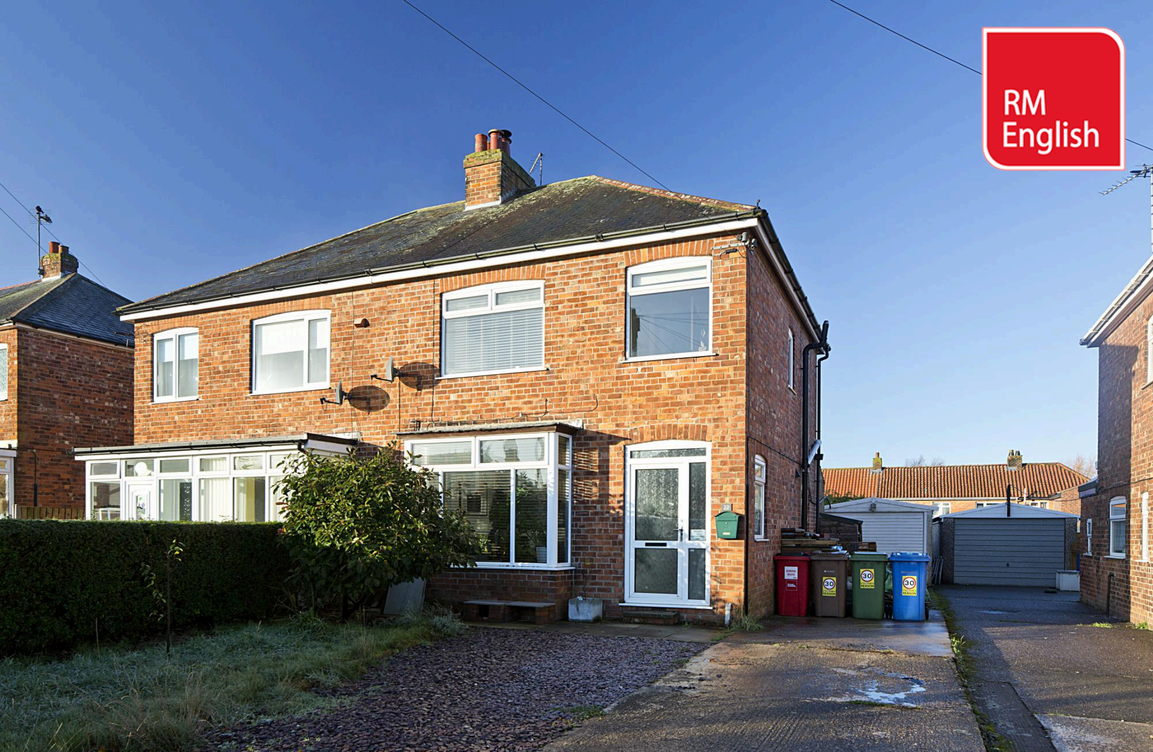
22 Cliffe Road, Market Weighton, YO43 3BN